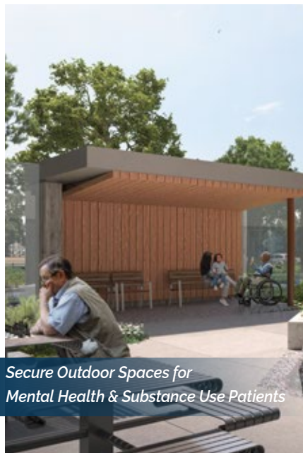
Secure Outdoor Spaces for Mental Health & Substance Use Patients