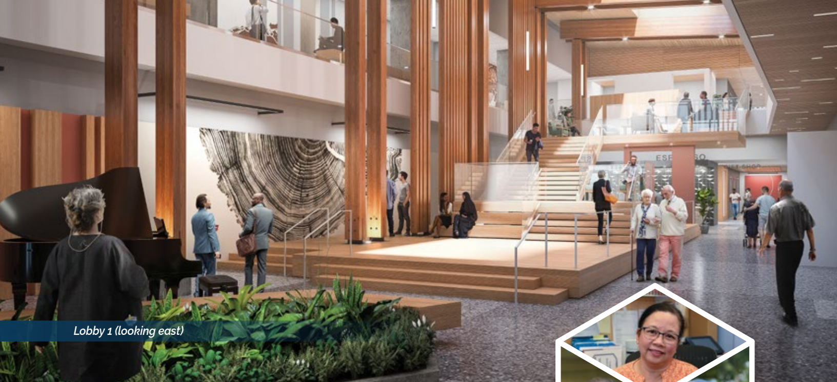
Lobby 1 (looking east)