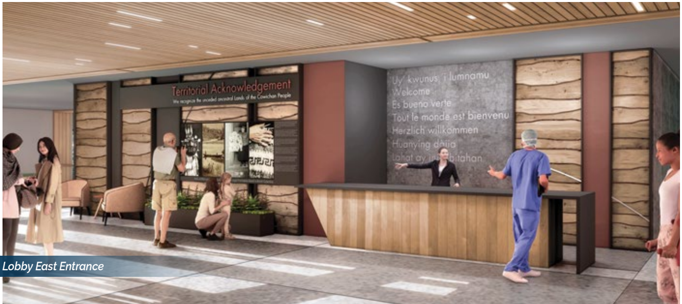
Lobby East Entrance

We invite you to be a part of this crucial project by considering a naming opportunity within the hospital. As a donor, you can make a positive impact on the healthcare of our community, while also leaving a lasting legacy in your name, your organization's name or in memory of a loved one.