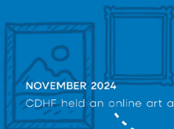
NOVEMBER 2024 CDHF held an online art auction

Donor Appreciation and 40th Anniversary celebration at the CDHF office, a chance to share thanks and updates with our generous communi-