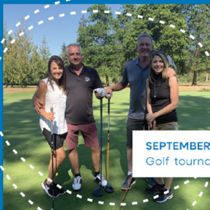
SEPTEMBER 2024 Golf tournament – raised $76,000.